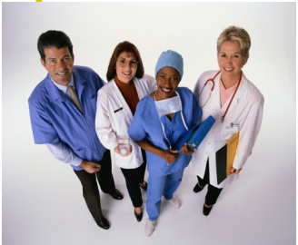
Your opinion will aide in our health care provider lead poisoning prevention outreach efforts.

The Lead Poisoning Prevention Program has embarked on a new initiative, called the Healthy Child Initiative (HCI). The mission of the HCI is to increase childhood lead testing rates 25% by 2015. Staff have been meeting and partnering with community leaders, agencies, parents, and medical providers throughout Alameda County to promote lead testing. Staff is currently partnering with Kaiser, the South Hayward Parish and the Promotores Academy at Tiburcio Vasquez Health Center. As medical providers, your participation and input is vital to this initiative and greatly needed; you can assist in this effort by taking a brief survey about your experience, beliefs, challenges and needs regarding lead testing. Your responses will guide us in developing more effective strategies and resources to support the challenges you face within your practice. See below for details: