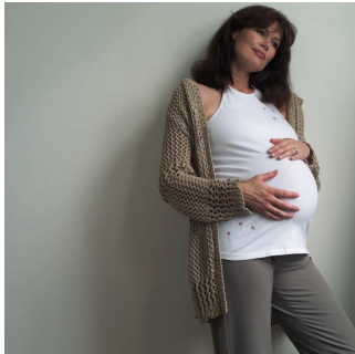
It is important for pregnant and lactating women to be tested for lead.

In the meantime, evaluate and screen at risk pregnant women for lead poisoning.