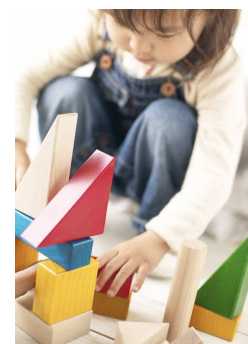
Ask your clients to stay connected to consumer product updates, such as those from CPSC.